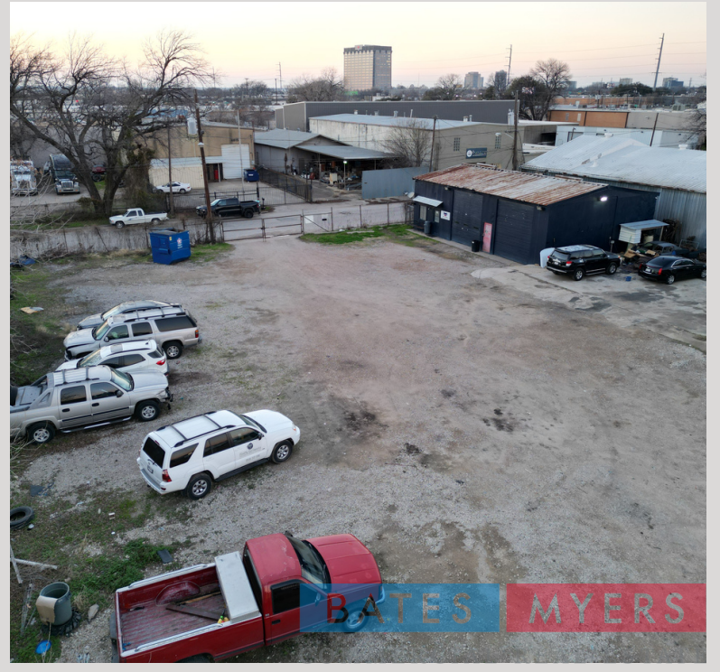
The information contained herein was obtained from sources believed reliable; however, Bates & Myers Company makes no warranties, or representations as completeness of accuracy thereof. The presentation submitted subject to errors, omissions, change of price, or conditions, prior sale or lease, or withdrawal notice.