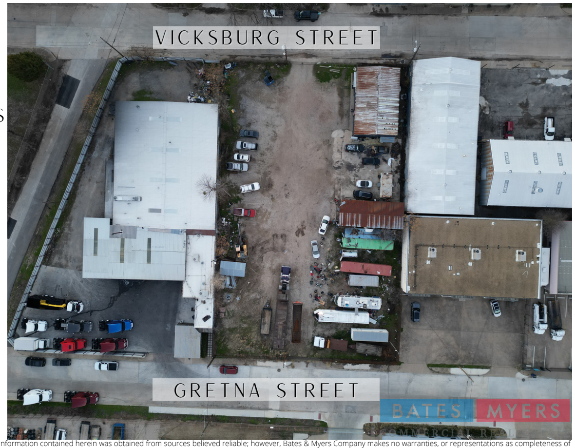
The information contained herein was obtained from sources believed reliable; however, Bates & Myers Company makes no warranties, or representations as completeness accuracy thereof. The presentation submitted subject to errors, omissions, change of price, or conditions, prior sale or lease, or withdrawal notice.